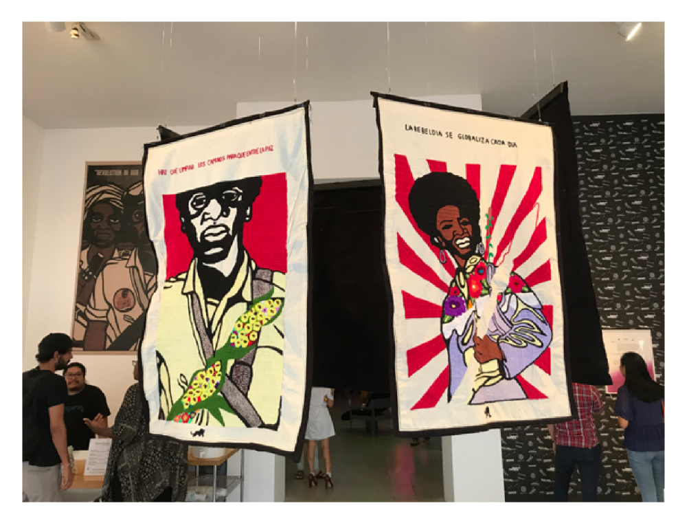
Emory Douglas posters

LACE did not shy away in celebrating its 40th anniversary, exemplifying the go big or go home mentality which was well received. Taking charge of the front gallery with "Emory Douglas: Bold Visual Language" prints from Douglas' service to the Blank Panther Party, then stepping into CAVERNOUS, a floating salon with all the amenities is the kind of show one would anticipate for a momentous occasion such as this.